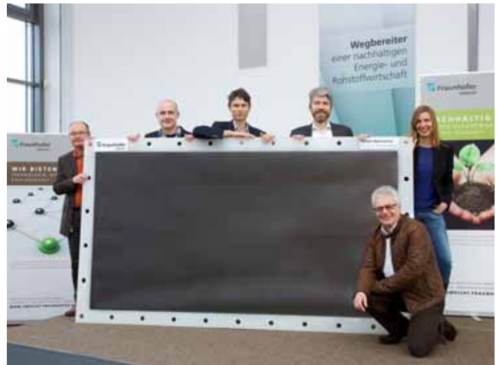
3.1 m 2 -sized bipolar plate welded with a plastic frame