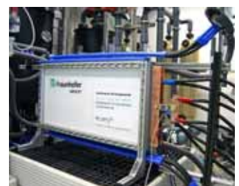
Left: high flexibility of the bipolar plate, right: stack with 4000 cm 2 cells